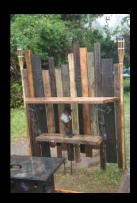
Fire pit ambience made from recycled materials