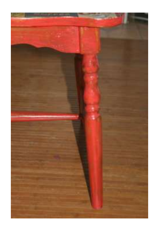
THEY REALLY DO COME UP LOOKING A MILLION DOLLARS