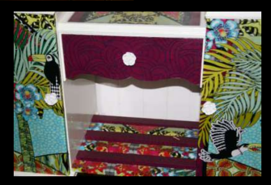
This was an old dressing table, I used chair legs and raised the height and inserted a slated base to the middle, even the vase is from the tip! It is covered in fabric. <a href="SEEE">SEE</a> MY LESSON ON ADDING FABRIC TO FURNITURE