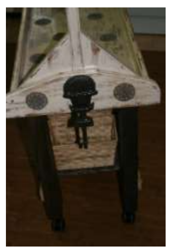
A mixture of up-cycled and recycled parts can make for very interesting furniture pieces.