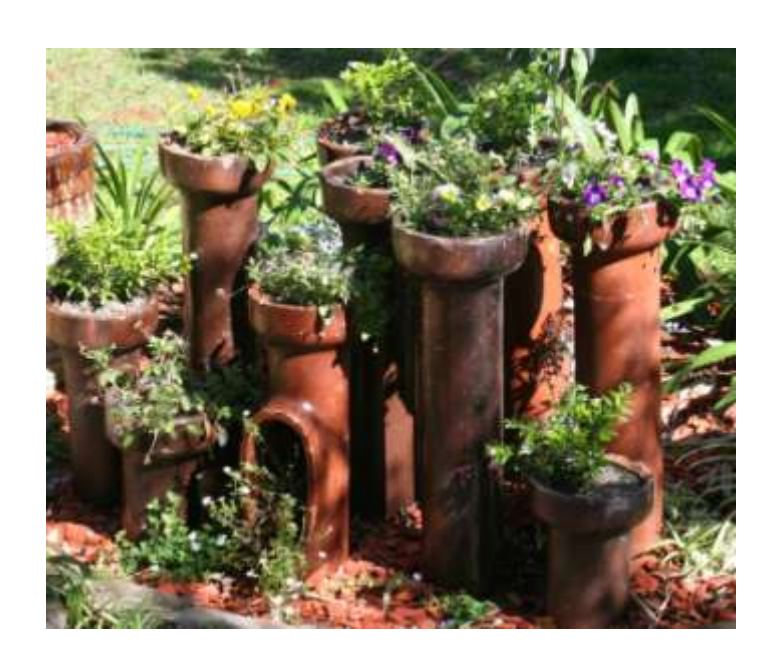
Sculpture garden made from old clay pipes.